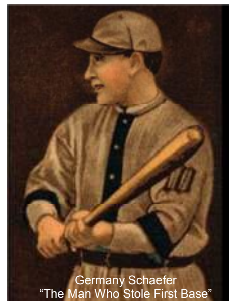
Germany Schaefer "The Man Who Stole First Base"