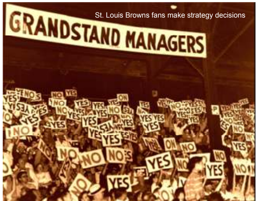
St. Louis Browns fans make strategy decisions